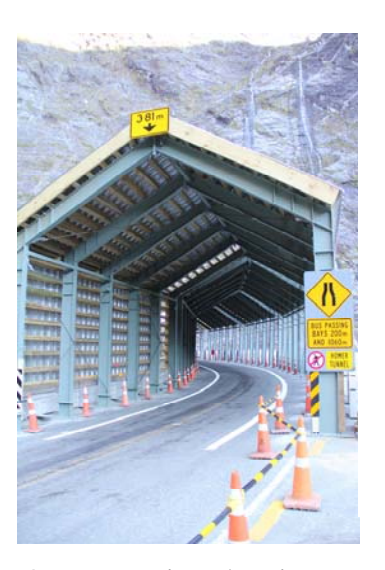
A temporary portal extension at the western entrance to the Homer Tunnel that opened in February 2013 helped the road return to close to normal operations.

The priority at this point was protecting road users. We were able to provide improved 24/7 access to users by mid-February following the construction of the temporary portal extension to provide protection from rockfall.