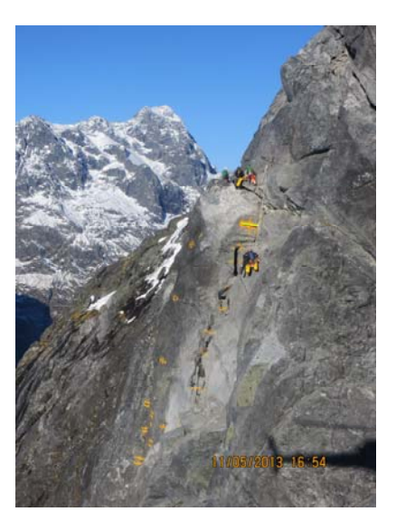
High altitude geotech experts carrying out rock face marking work.

Throughout this time the NZ Transport Agency and their team of experts have been working towards a permanent solution. We were aiming to manage the bluff through winter and undertake any significant rock removal by blasting or other means in the spring. However within the last two weeks, our rope access inspection team indicated that the pinnacle was in worse condition than previously understood. Last week final onsite inspections confirmed that the pinnacle is only 15% to 20% connected to the mountain and it is likely to fall down with ice build-up behind it through winter. We are now in a position where we cannot wait until the spring to remove this feature as we cannot guarantee safety with it in-situ through the winter.