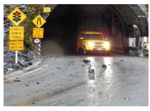
Pieces of rock that hit the Milford Road at the western entrance to the Homer Tunnel after a section of the "Diamond Pinnacle" high above the tunnel entrance broke off in November 2012

During routine inspection on 11 November 2012 the NZ Transport Agency's Milford Road contractor came across rocks on the road at the western portal of the Homer Tunnel. Further investigation showed that a large section of rock had broken away from a feature known to climbers as the 'Diamond Pinnacle' on a bluff high above the road.