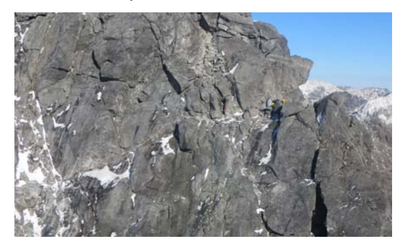
Rope access lines that have been secured to the rock face allow workers to move safely around the rock fall site.

What remained of the pinnacle on the bluff was a 20plus metre, 2000 tonne column of rock which presented stability concerns.